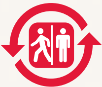
Tailgate Detection System