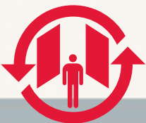
Security Swing Door System