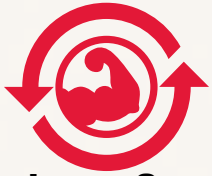
Maximum Security System