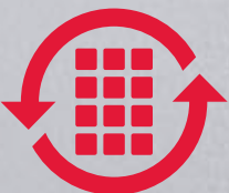
Employee Entrance System