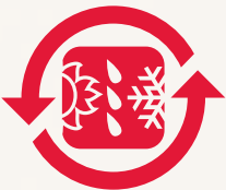
Weatherized Outdoor Area System