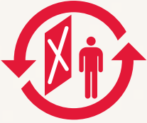
Restricted Access System