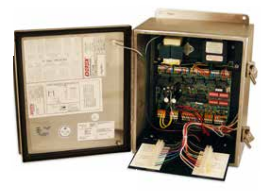
106595-1 Shown open