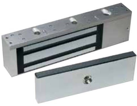
628 Aluminum Finish

The Detex ML-1500 Series, Grade 1 Magnetic Lock meets or exceeds 1500 lbs. of holding force to the separation point. This is powerful enough to hold many doors against a force that will deform or destroy the door before the ML-1500 can be forced open. Positive, instantaneous failsafe operation is guaranteed, with no moving parts to bind or wear, the ML-1500 Series will release immediately when de-energized by Fire Life Safety System or remote controls.